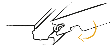
INSTALLATION METHOD 3 angle