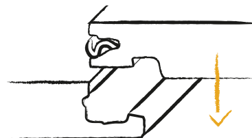
INSTALLATION METHOD 1 fold-down